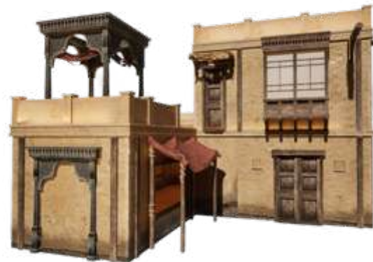
■ No. 015 ■ Area: 51m 2