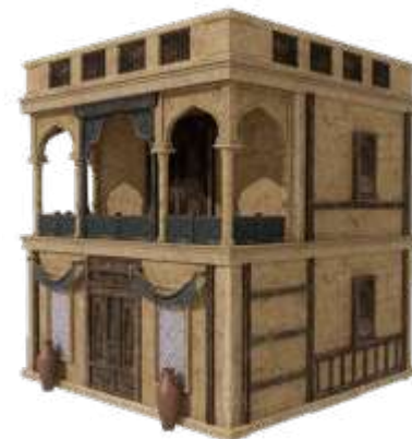
■ No. 018 ■ Area: 50m 2