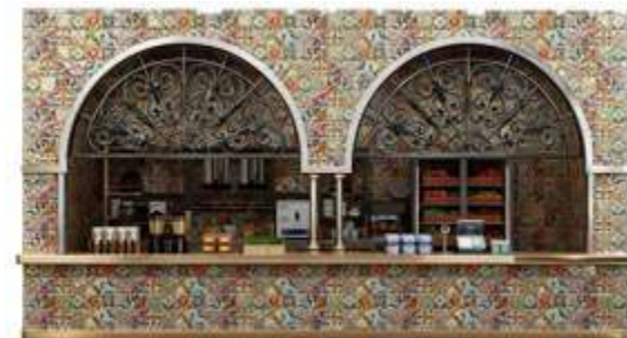
■ No. 027 ■ Area: 20m 2