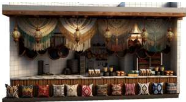
■ No. 019 ■ Area: 18m 2