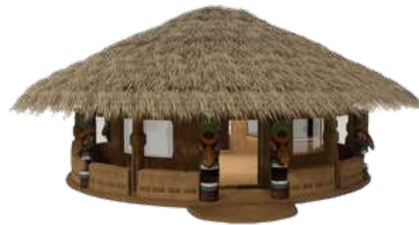
■ No. 045 ■ Area: 90m 2