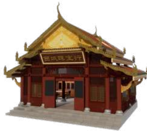
■ No. 026 ■ Area: 49m 2