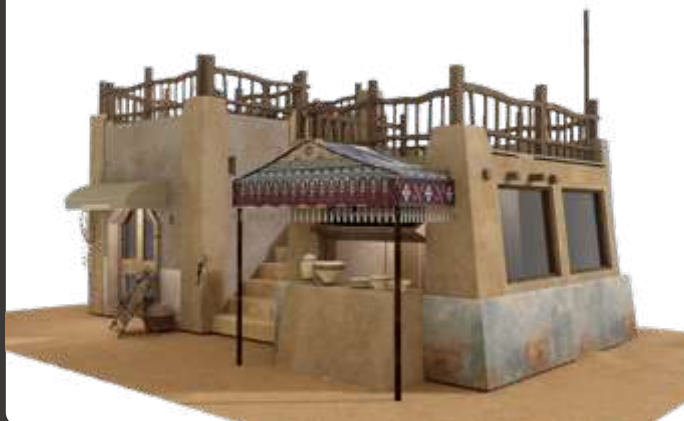
■ No. 011 ■ Area: 52m 2