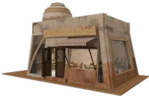
■ No. 007 ■ Area: 51m 2