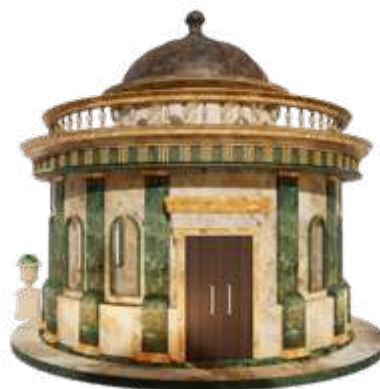
■ No. 038 ■ Area: 50m 2