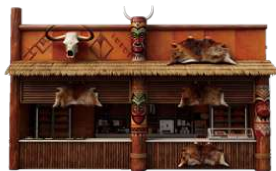
■ No. 011 ■ Area: 24m 2