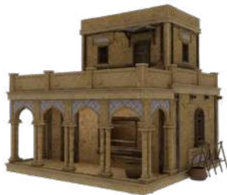
■ No. 017 ■ Area: 46m 2