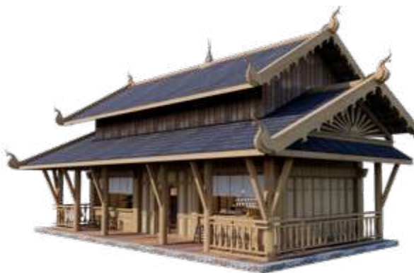
■ No. 023 ■ Area: 60m 2