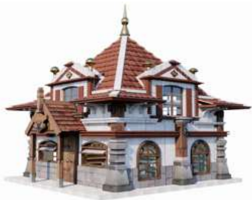
■ No. 028 ■ Area: 52m 2