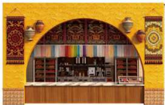
■ No. 010 ■ Area: 52m 2