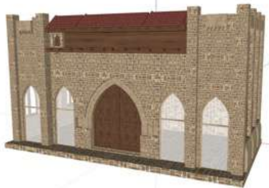
■ No. 031 ■ Area: 47m 2