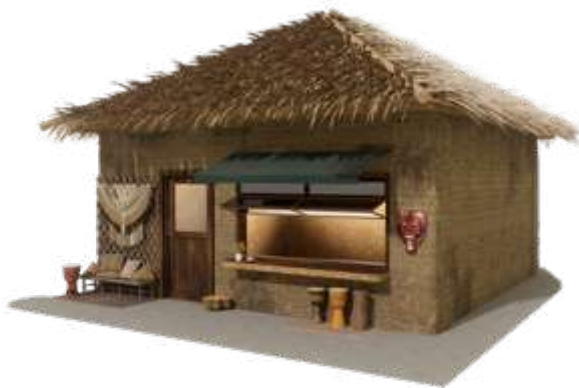
■ No. 004 ■ Area: 42m 2