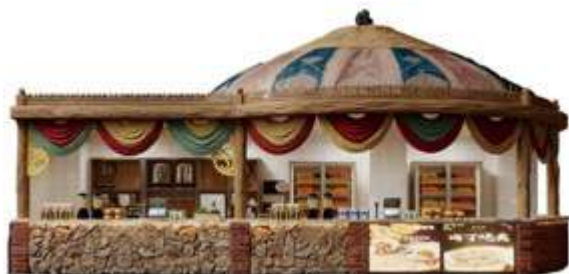
■ No. 025 ■ Area: 30m 2