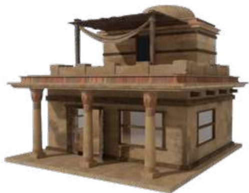
■ No. 016 ■ Area: 52m 2