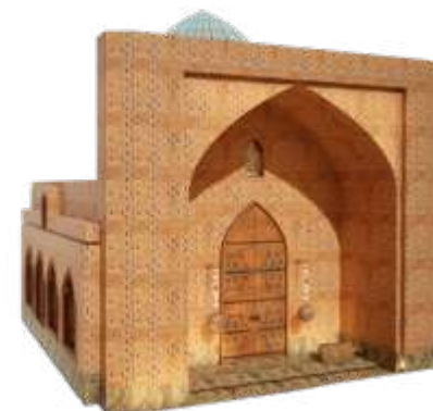
■ No. 042 ■ Area: 52m 2