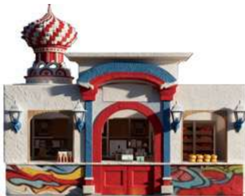
■ No. 020 ■ Area: 21m 2