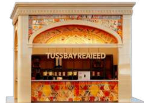
■ No. 033 ■ Area: 20m 2