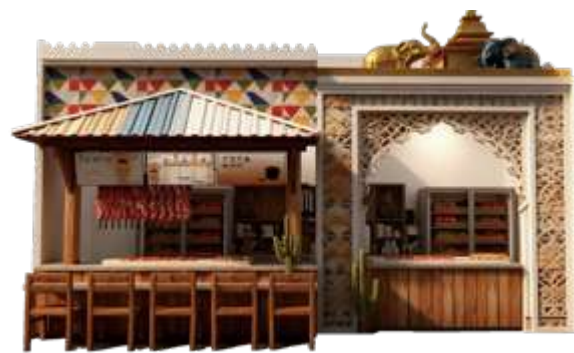
■ No. 012 ■ Area: 29m 2