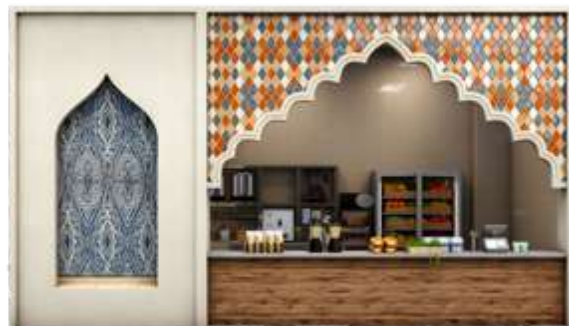
■ No. 022 ■ Area: 21m 2