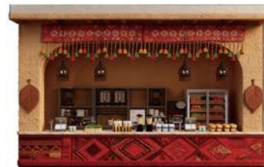
■ No. 021 ■ Area: 20m 2