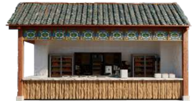
■ No. 006 ■ Area: 23m 2