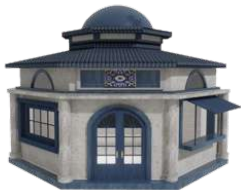
■ No. 040 ■ Area: 41m 2