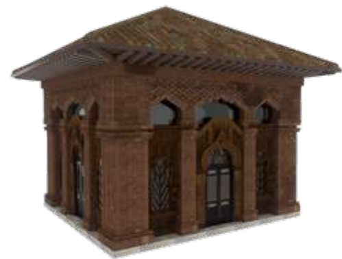
■ No. 021 ■ Area: 45m 2