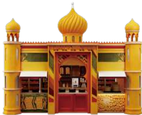
■ No. 008 ■ Area: 19m 2