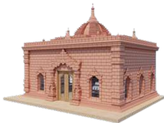
■ No. 020 ■ Area: 63m 2