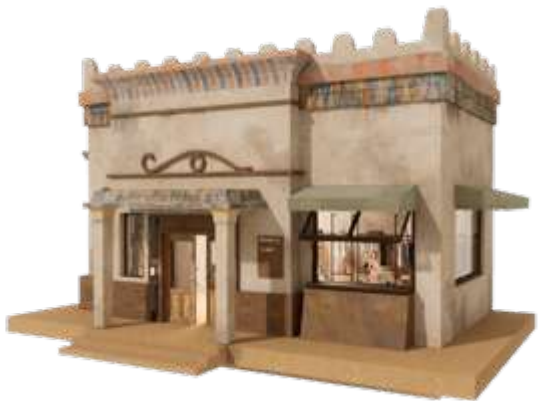
■ No. 013 ■ Area: 56m 2