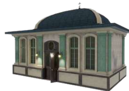
■ No. 030 ■ Area: 45m 2