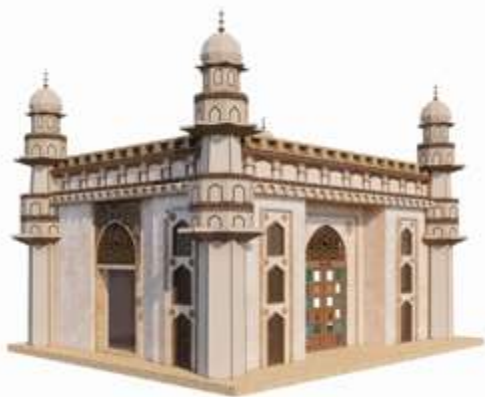
■ No. 001 ■ Area: 68m 2