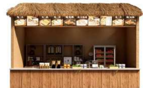
■ No. 030 ■ Area: 20m 2