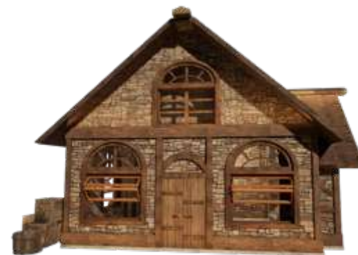
■ No. 036 ■ Area: 55m 2