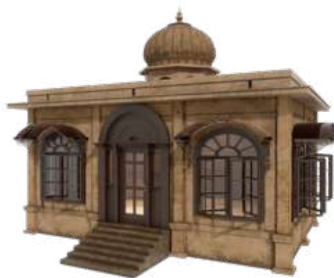
■ No. 041 ■ Area: 48m 2