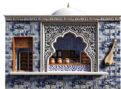
■ No. 009 ■ Area: 24m 2