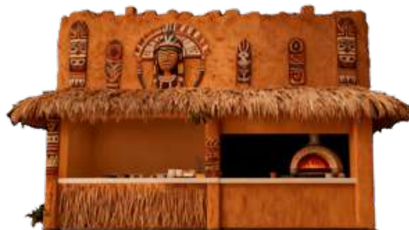
■ No. 026 ■ Area: 20m 2