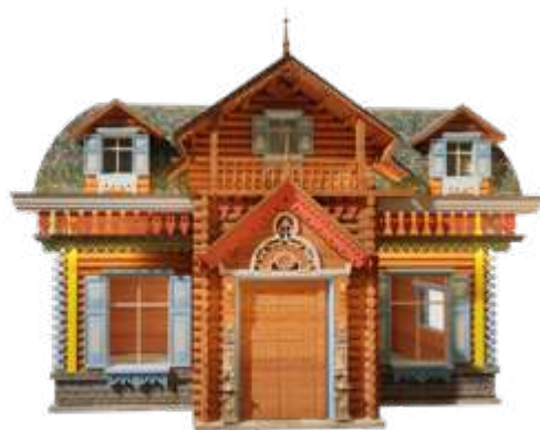
■ No. 035 ■ Area: 47m 2