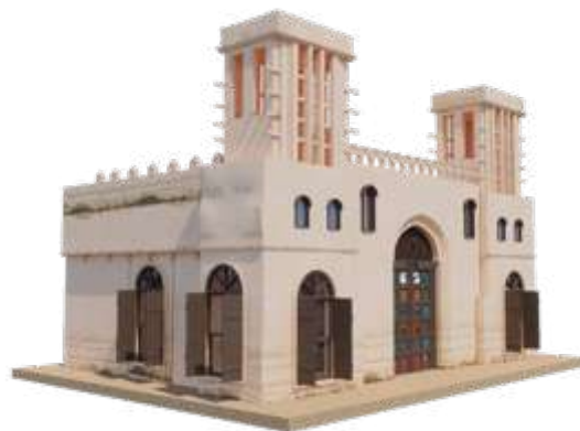
■ No. 002 ■ Area: 78m 2