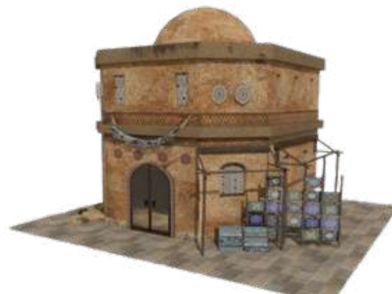
■ No. 009 ■ Area: 40m 2