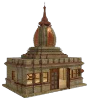
■ No. 019 ■ Area: 45m 2