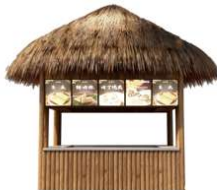
■ No. B ■ Area: 15m 2