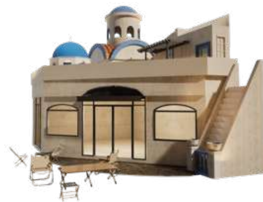
■ No. 033 ■ Area: 50m 2