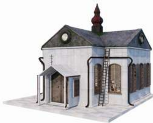
■ No. 029 ■ Area: 56m 2