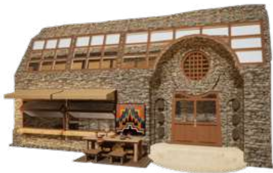
■ No. 046 ■ Area: 61m 2