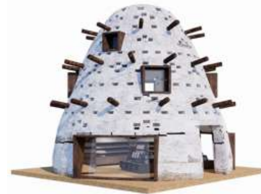
■ No. 003 ■ Area: 50m 2