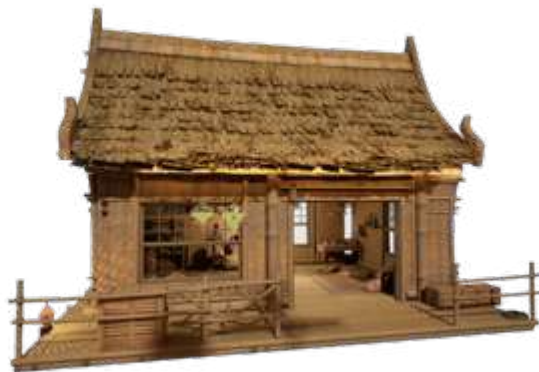
■ No. 044 ■ Area: 34m 2