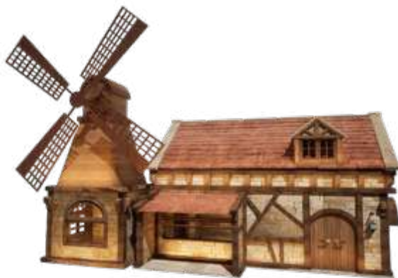
■ No. 037 ■ Area: 62m 2