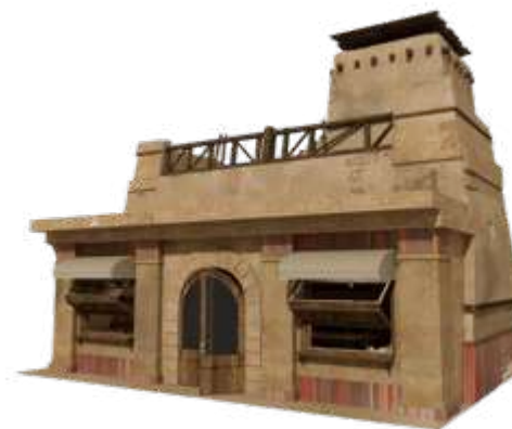
■ No. 012 ■ Area: 50m 2