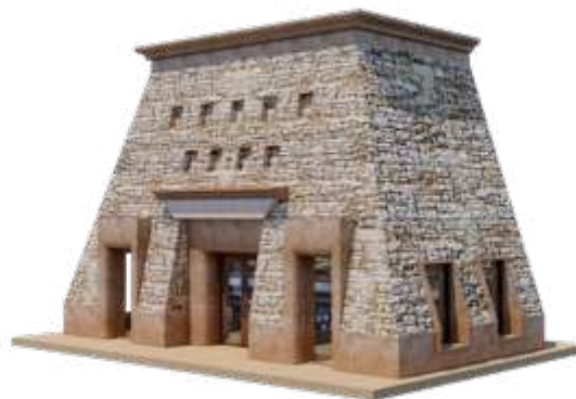
■ No. 005 ■ Area: 70m 2