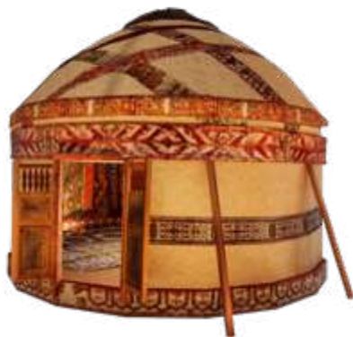
■ No. 047 ■ Area: 68m 2