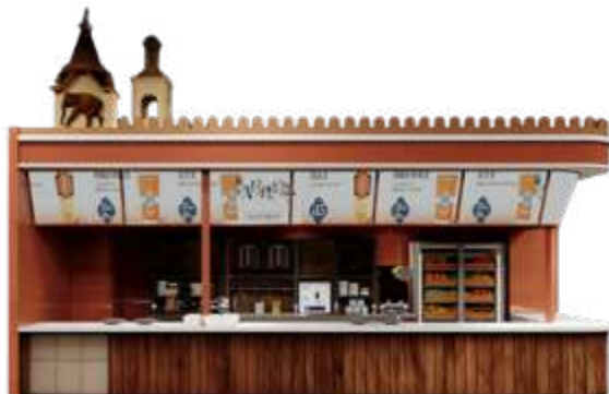
■ No. 028 ■ Area: 20m 2