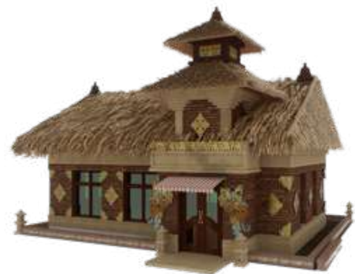
■ No. 024 ■ Area: 62m 2