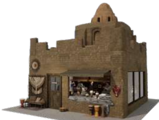
■ No. 014 ■ Area: 44m 2