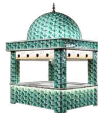
■ No. C ■ Area: 16m 2