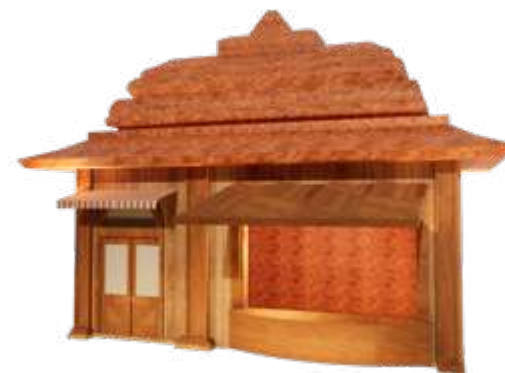
■ No. 039 ■ Area: 37m 2