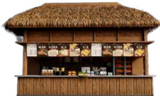
■ No. 032 ■ Area: 20m 2