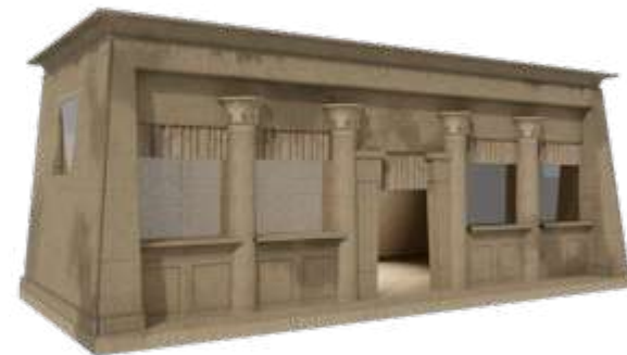
■ No. 006 ■ Area: 60m 2