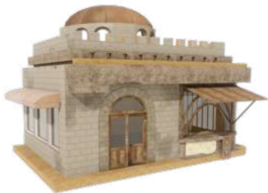
■ No. 010 ■ Area: 52m 2