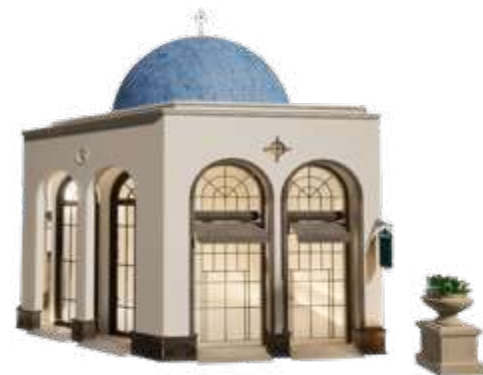
■ No. 048 ■ Area: 28m 2