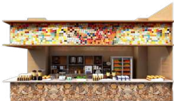
■ No. 031 ■ Area: 30m 2