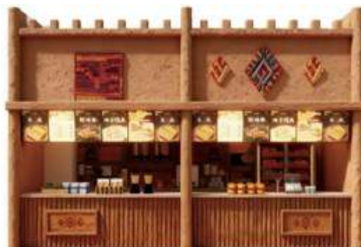
■ No. 023 ■ Area: 20m 2