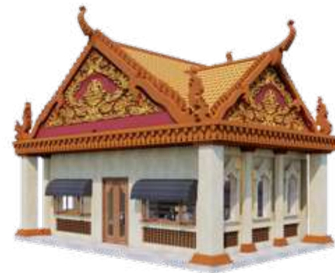
■ No. 027 ■ Area: 40m 2