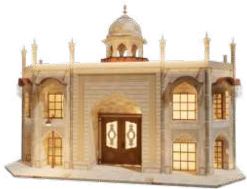
■ No. 043 ■ Area: 68m 2