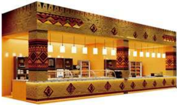
■ No. 001 ■ Area: 47m 2