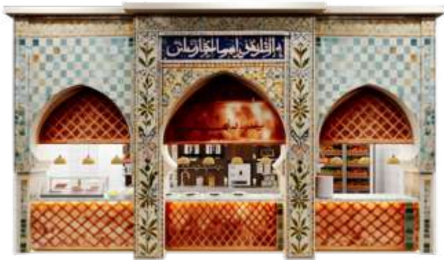
■ No. 004 ■ Area: 21m 2