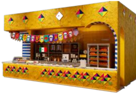
■ No. 002 ■ Area: 21m 2