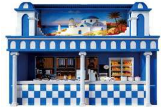
■ No. 003 ■ Area: 21m 2