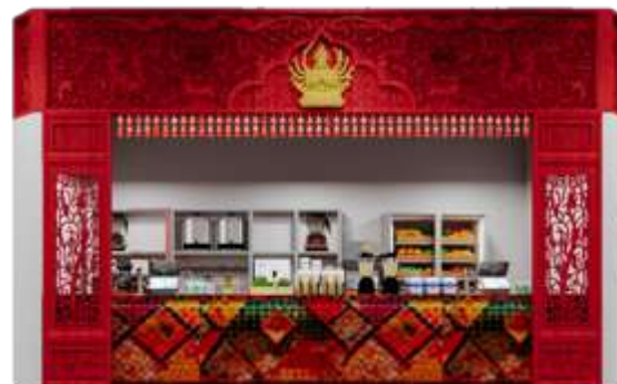
■ No. 029 ■ Area: 20m 2