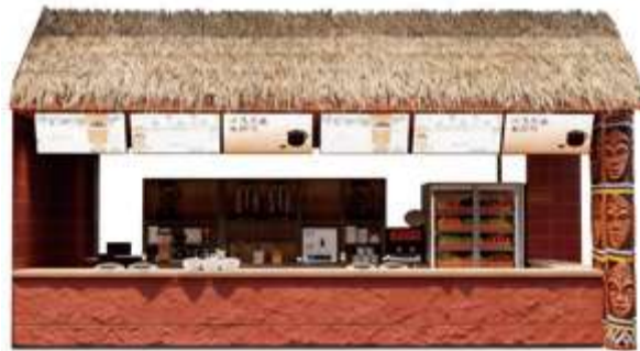
■ No. 005 ■ Area: 23m 2