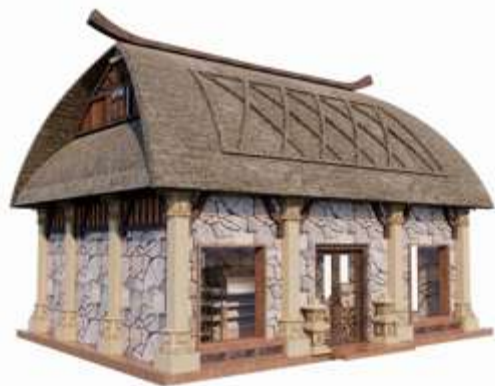
■ No. 022 ■ Area: 65m 2