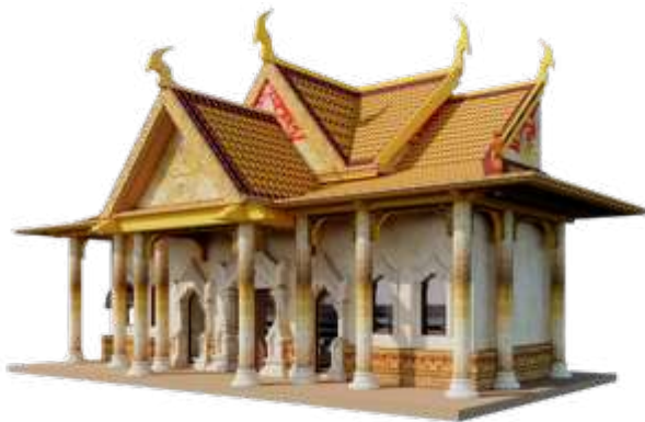
■ No. 025 ■ Area: 65m 2