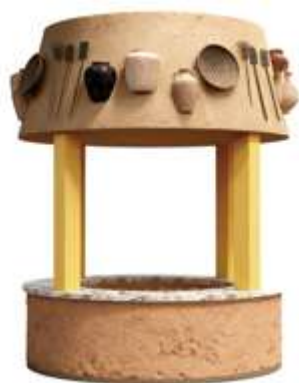
■ No. A ■ Area: 15m 2