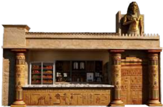
■ No. 007 ■ Area: 21m 2