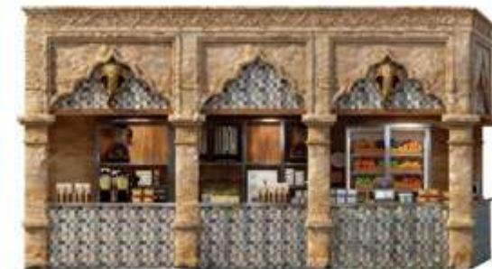
■ No. 024 ■ Area: 22m 2