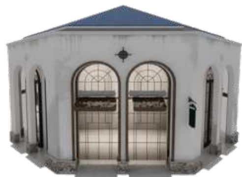
■ No. 034 ■ Area: 54m 2