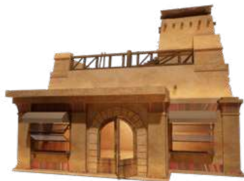
■ No. 008 ■ Area: 46m 2