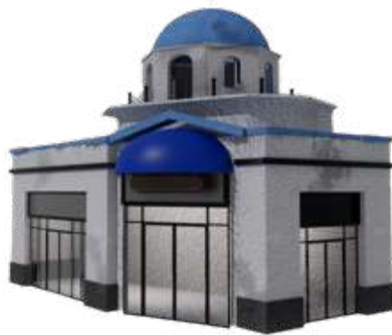
■ No. 032 ■ Area: 49m 2